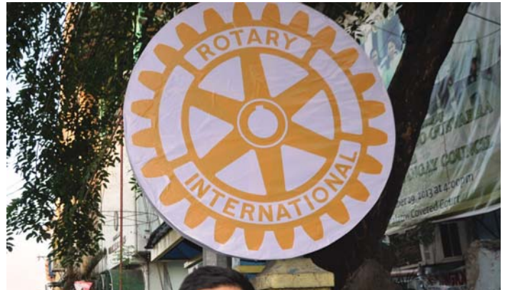
Rotary Club of Metro Pasig