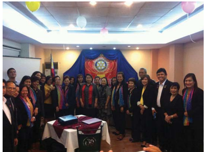
Rotary Club of San Mateo Midtown