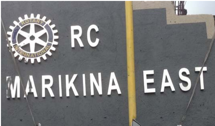
Rotary Club of Marikina East