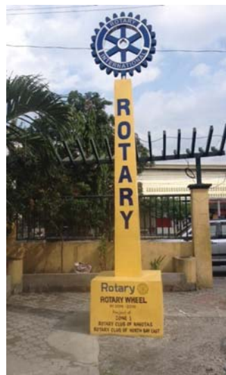
Rotary Club of Navotas & Rotary Club of North Bay East