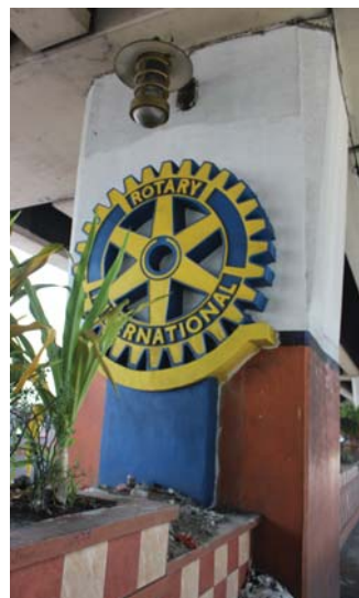
Rotary Club of Caloocan