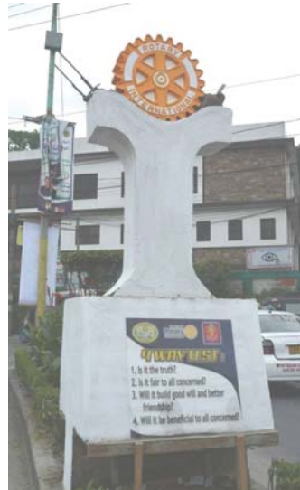
Rotary Club of Rodriguez