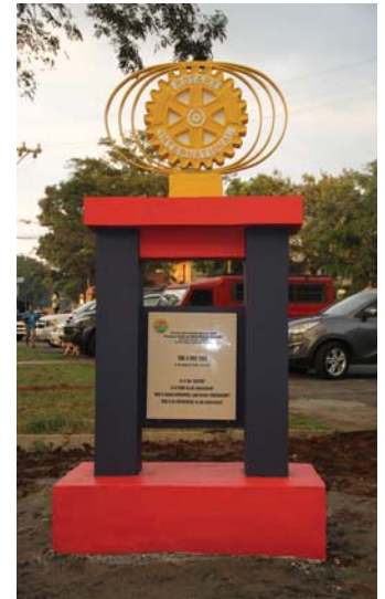
Rotary Club of Marikina Valley