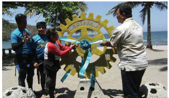
Rotary E-Club of San Juan