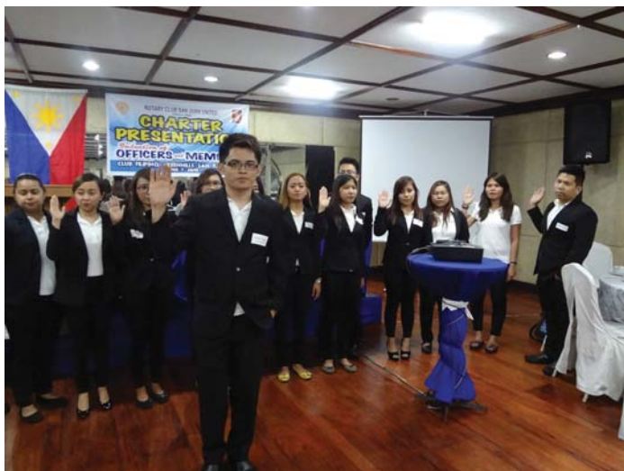
Rotary Club of San Juan United