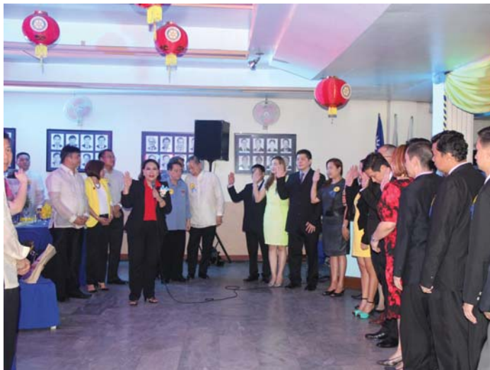
Rotary Club of Malabon Central