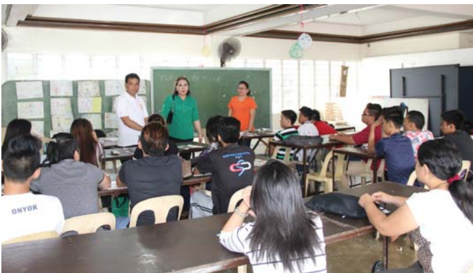
Alternative Learning System