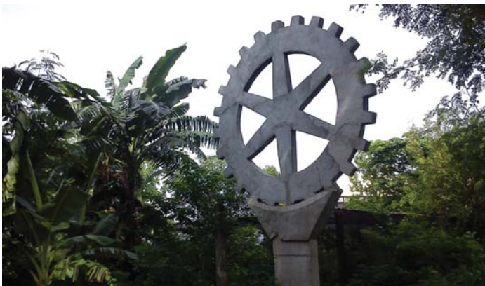
Rotary Club of Tanay