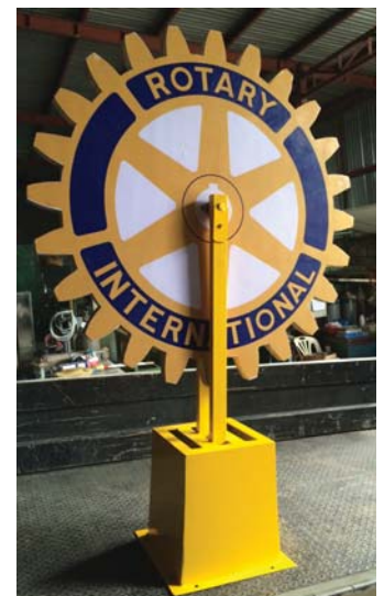
Rotary Club of Taytay