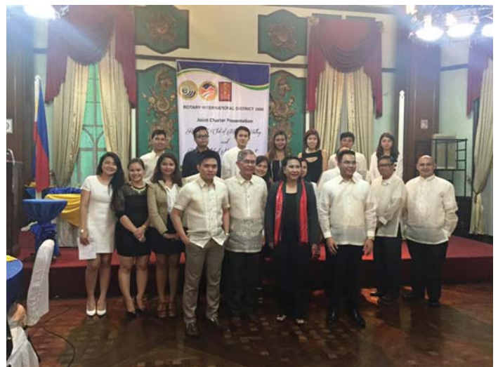
Rotary E-Club of Marikina Valley & Rotary Club of Marikina Summit