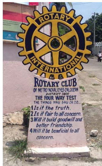
Rotary Club of Metro Novaliches Caloocan