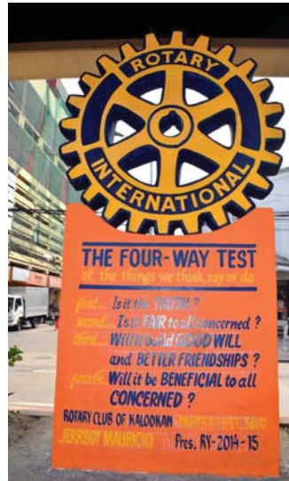
Rotary Club of Kalookan North