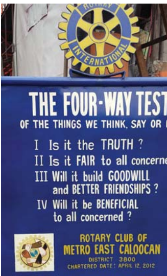
Rotary Club of Metro East Caloocan