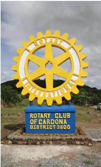
Rotary Club of Cardona