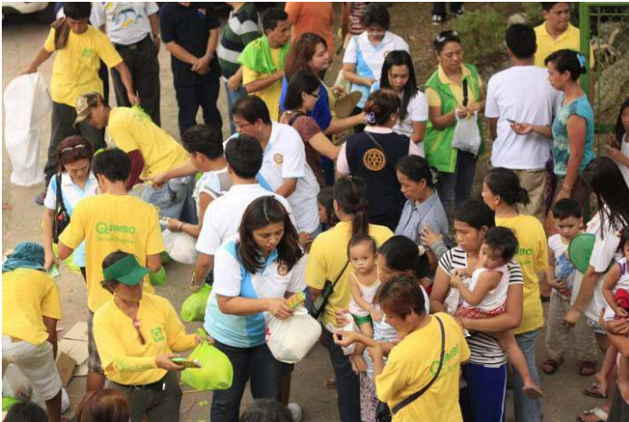
Photos : 1st Row (left to right) Soup kitchen of RC Marikina East and its Rotaractors at Balubad; 2nd Row (left to right) RC Metro Marikina with Rotaractors distributed relief goods to affected residents of Nangka; 3rd Row (left to right) RC Marikina and Inner Wheel Club of Marikina members prepares and distributes; RC Metro Marikina with RAC Metro Marikina distribute goods in Nangka; RC Marikina North distribute relief goods; 4th Row - Project Hope of RCs Marikina North and Lucena South held at H. Bautista Elementary School.