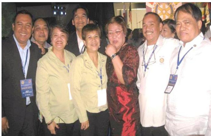
Above and below : Senator Chiz Escudero and Secretary Laila de Lima take time for a photo opportunity with DISCON participants.