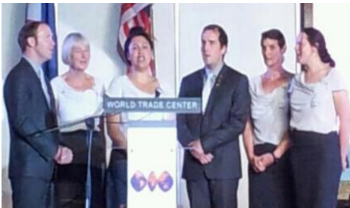
Above : The GSE In-bound Team from New Zealand District 9980 express their appreciation via a song rendition at the DISCON .