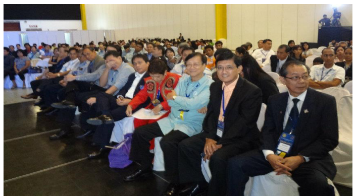
Above: A view of the big crowd that came to witness the performance of the 9 zones during the Talent Night of DISCON 2012.