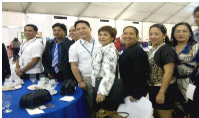
Above: Incoming Presidents are given a glimpse of what things to come as they attend their first breakfast meeting in the district.