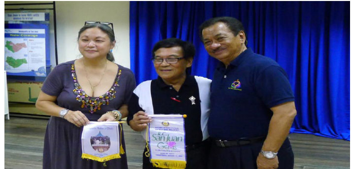
Above: Exchange of bannerettes between RC Metro Manila Gems and RC Paradise Valley after the Medical Mission.

Saturday was another one of those days where we really showed the world what Rotary is all about. In Barangay Pineda, Pasig City, our friends of RC Paradise Valley in San Diego, California, the club that regularly hosts DGE's from the Philippines during their training in San Diego at the International Assembly, performed a Medical Mission to more than 800 beneficiaries. They did around 89 dental, 21 minor surgeries, and the rest were consultations where the tons of medicine that they had brought with them from the US was distributed for free to the poor and indigent patients.