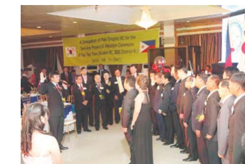
Tres Escalon Taytay