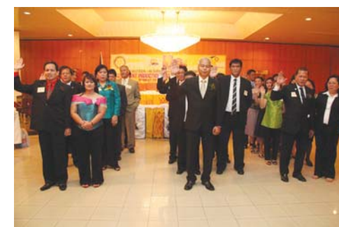
East Rizal, Metro Cainta & Suburban East Rizal