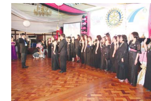
San Juan Gems