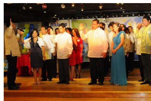
Dagat-dagatan, Navotas & North Bay