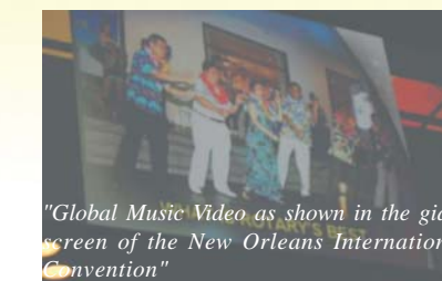
"Global Music Video as shown in the giant screen of the New Orleans International Convention"