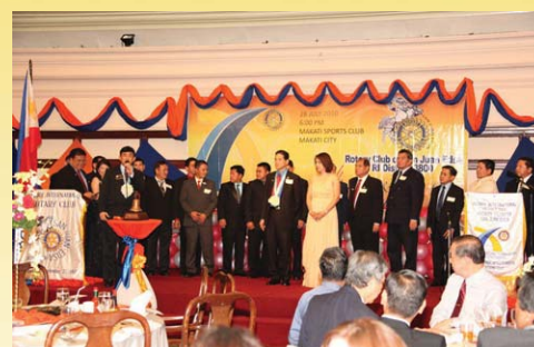
San Juan EDSA