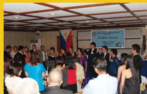
Cosmopolitan San Juan