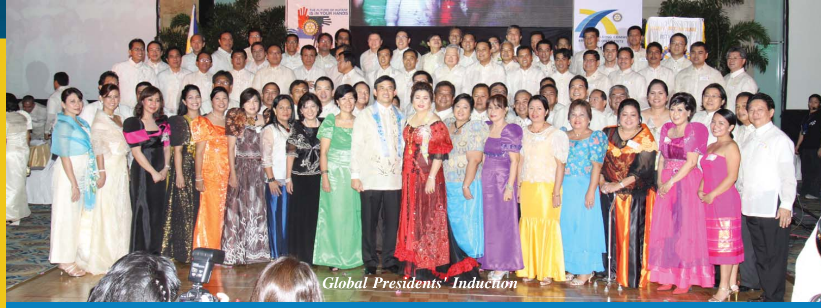
Global Presidents' Induction