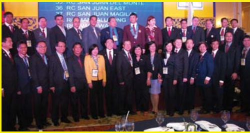
ERFY Rotary Clubs