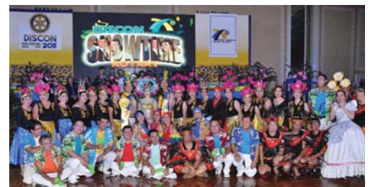
TALENT NIGHT: Champion - Rizal Zone, 2nd Place - Mandaluyong Zone, and 3rd Place - Marikina Zone