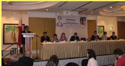
Majestic Team Breakfast Meeting