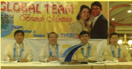
Global Team Branch Meeting