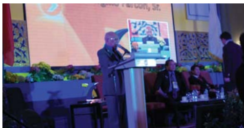
Conference Resolutions - PP Ver Farcon