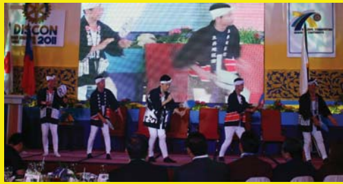
GSE Inbound Team Cultural Presentation