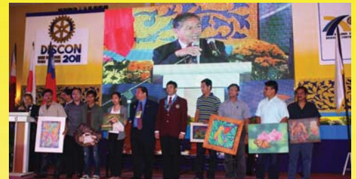
Art Exhibit Winners