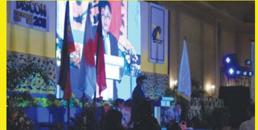
Speaker - MMDA Chair Francis Tolentino