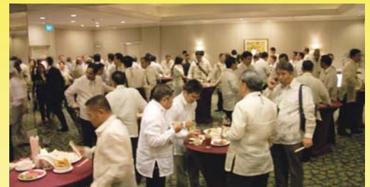
House of Friendship