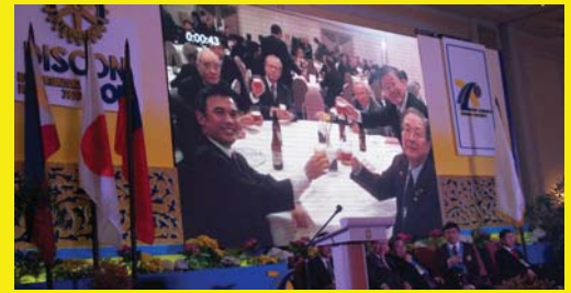
GSE Outbound Team AudioVisual Presentation