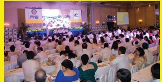
DISCON 2011 Delegates