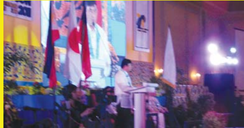
State of the District Address - DG Jun Farcon