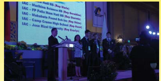
Presentation of New Interact Clubs