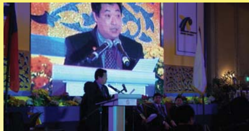
Presentation of New Rotaract Clubs