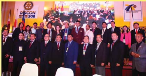
DISCON First Time Attendees